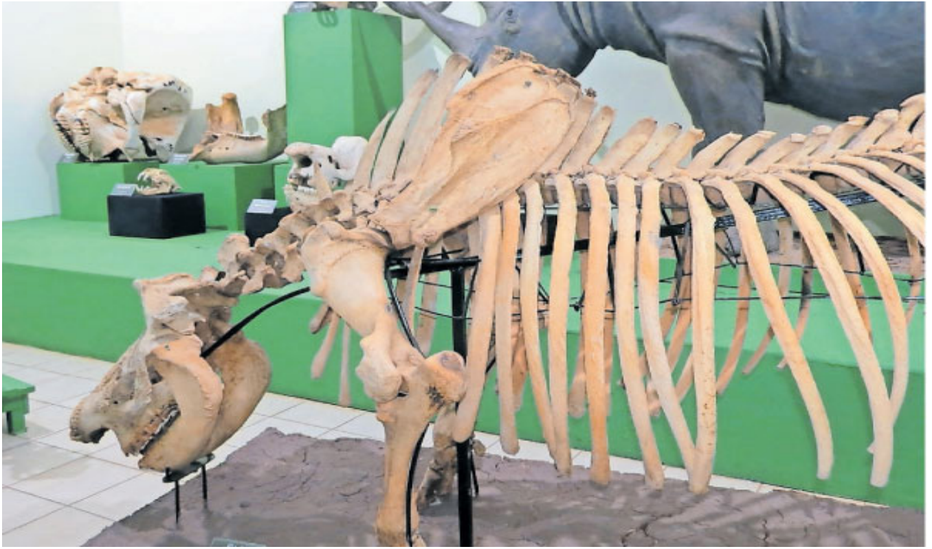
Above: New attraction, the skeleton of Karanja the black rhino who died on Christmas Eve in 2004. The Italian Embassy sponsored the mounting of the most photographed rhino in Kenya. Karanja is based at the Whispering Bones display at the semi-permanent exhibition area.