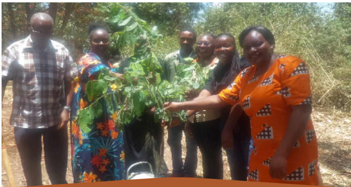
Above: The Nairobi Gallery in collaboration with the August Peace Memorial club, NMK Botany department Marked the International day of Forests on 23 rd March 2019 by planting indigenous trees at the Karen Blixen Museum Nature trail with both children and a group of elderly people.