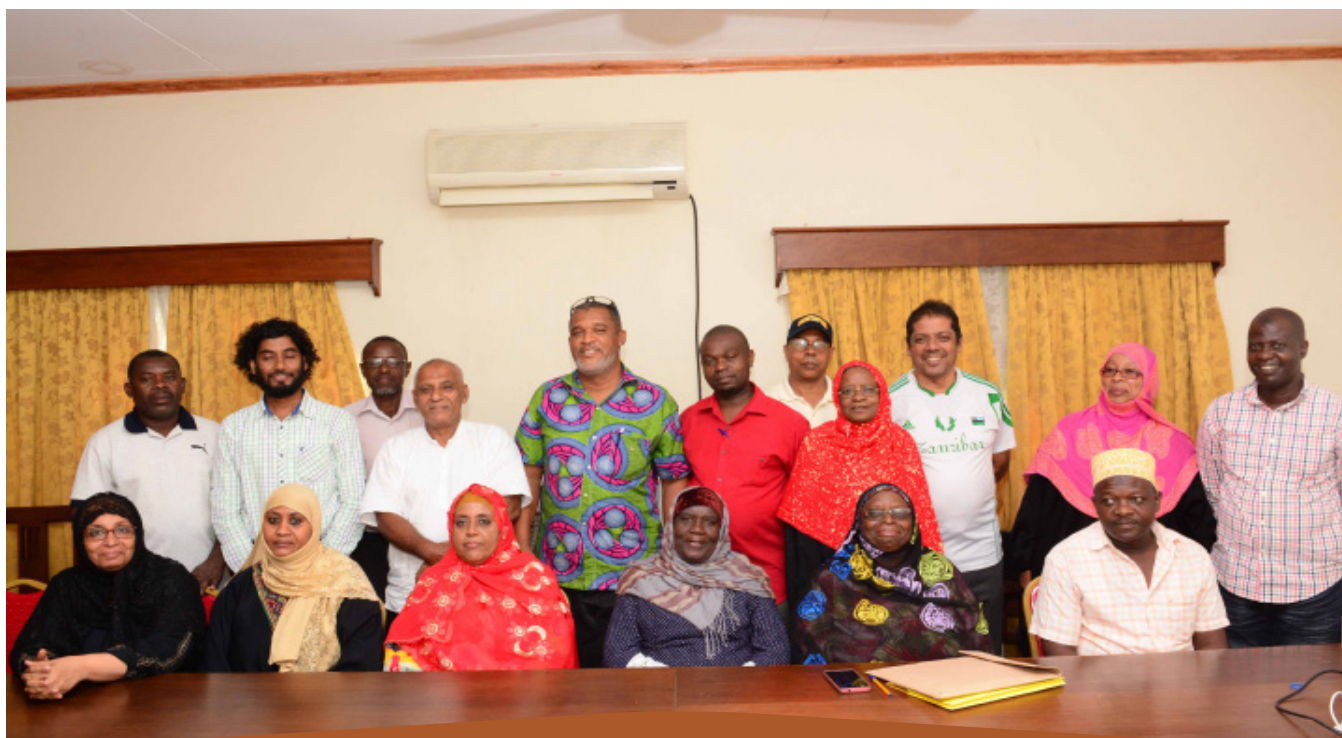
The Kenya Heritage Training Institute held a workshop dubbed 'Community Involvement in Heritage Management' on 25 th February 2019. The participants were drawn from Zanzibar Stone Town Heritage Society. Trainers were drawn from National Museums of Kenya Coast region's pool of experts in heritage management.