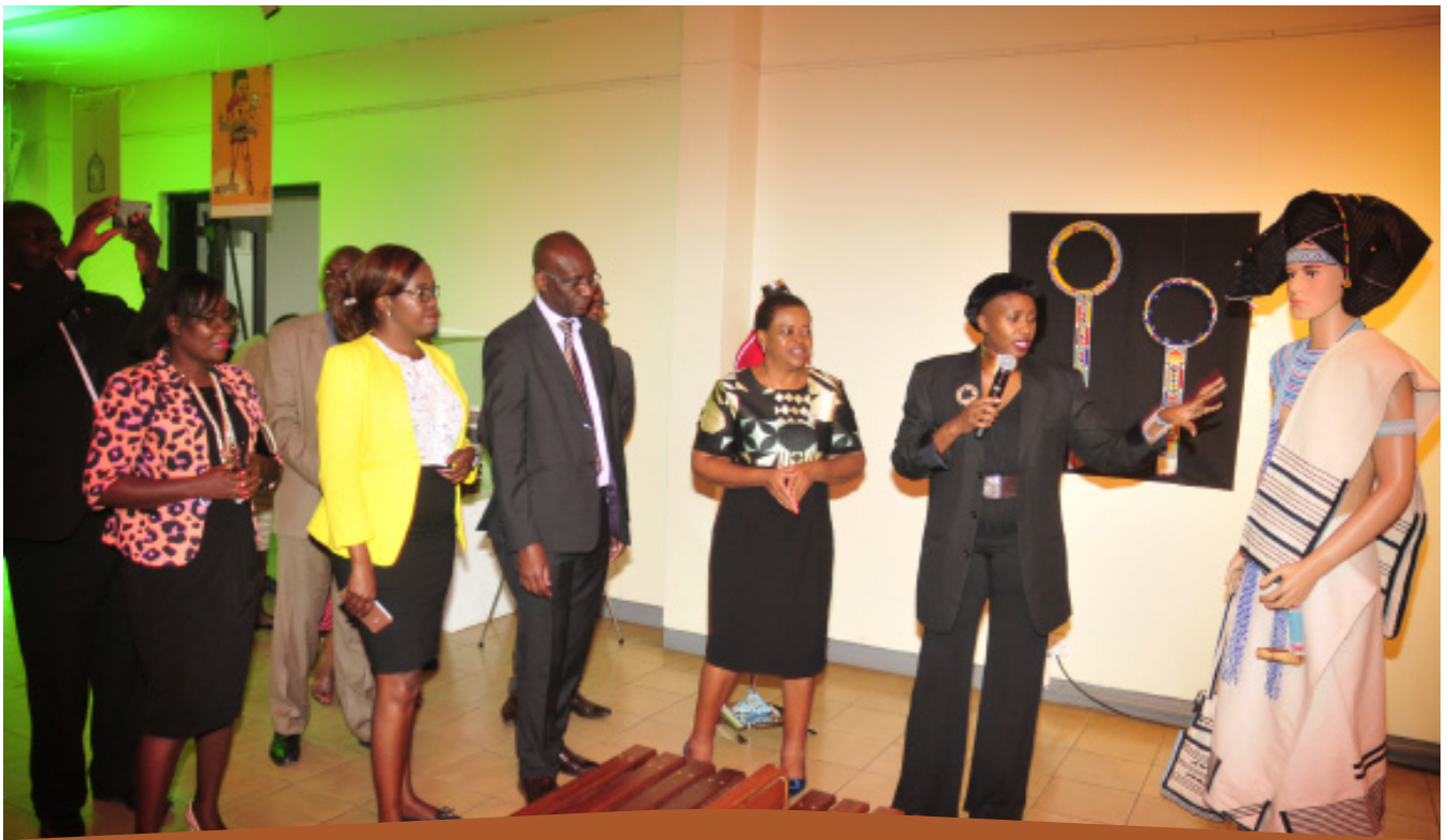
NMK hosted a one-week exhibition, through the South African Embassy, celebrating South Africa's 25 years of democracy and freedom. The cultural week culminated in the signing of a bilateral agreement between Kenya and South Africa on matters of art, culture and heritage exchange.