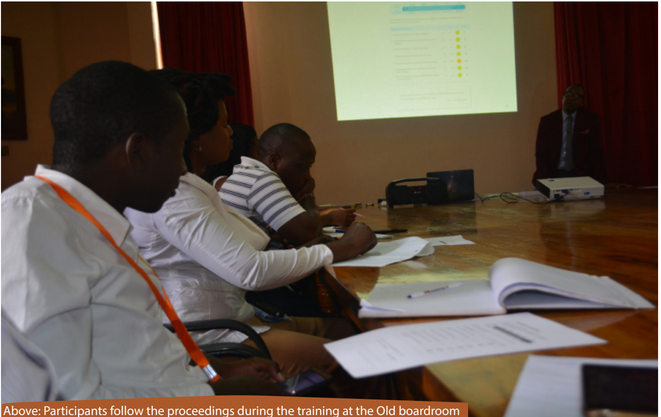
Above: Participants follow the proceedings during the training at the Old boardroom