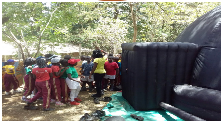
Below: Children line up to enter the virtual reality dome at the Nairobi National Museum.

NNM Education section hosted the Kadzo's Planet children' activity on 23 rd March. The theme for the activity was primates of the Museum. The activity included a guided tour of the Great Hall of Mammals gallery, storytelling, touring the gallery, games, face painting, art and crafts.