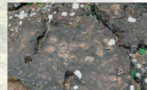
Play prehistoric stone slab bau game

Bau game is popular across Africa and the Caribbean and is played by two or more people who drop pebbles into opposite sets of dug out indentations in wood.