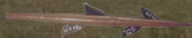
Arrow shaft fitted with crescents to show possible use

There is evidence in the form beach sands that a fresh water Lake once extended right to the base of the hill; turning the hill into a peninsular or even an island. The mighty prehistoric lake is believed to have covered the valley from Nakuru to Lake Elementaita about 8,500 years ago. Traces of it have been found at Hyrax Hill, the Nakuru Burial Site, Gambles.