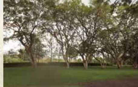
Grounds for hire