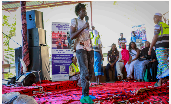
An engaging spoken word artist enchants the audience, showcasing the beauty and rhythm of Kiswahili during the vibrant celebrations