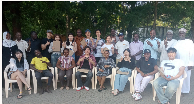
Group photo of students and NMK-HTI staff on the final day of the program