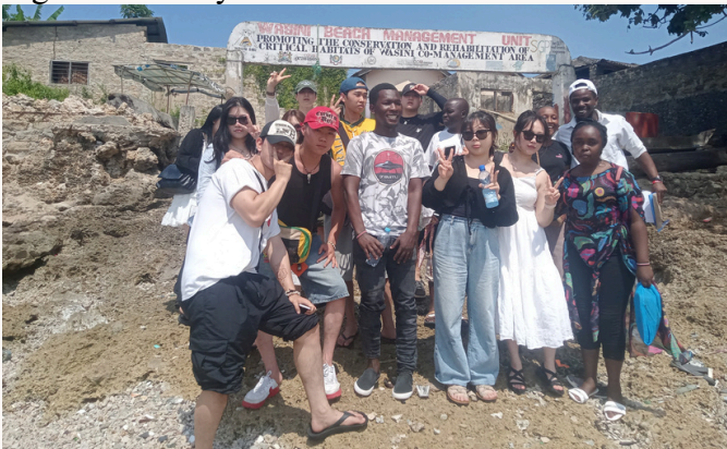
Excursion at Wasini Island

In the second week, the program advanced to practical language applications, starting with telling time and discussing dates. Students participated in a Swahili cuisine workshop, where they learned to prepare traditional dishes such as Mahamri and Chapati. They also explored clothing and colors through role plays set in various contexts, including weddings and market scenarios. A visit to a local mosque allowed students to engage in discussions about cultural and religious practices, adhering to appropriate dress codes.