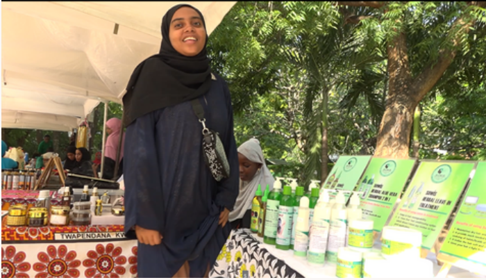
An exhibitor showcasing some of the herbal medicine