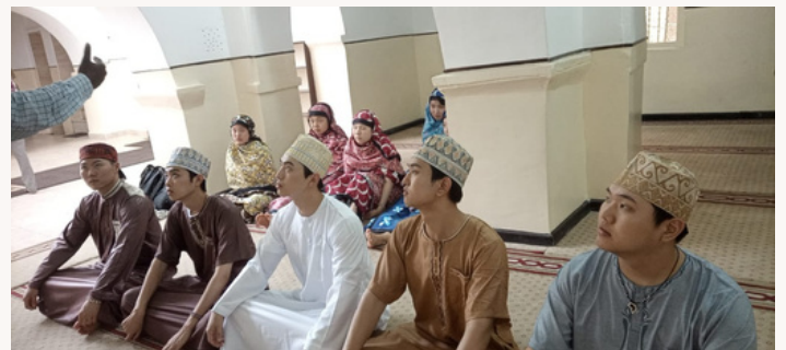
Students at the Mosque

The curriculum included health-related vocabulary, with students describing body parts and ailments through role plays and songs. They practiced shopping and bargaining in a simulated market environment, culminating in a field trip to McKinnon Market where they could apply their language skills in real-life situations. The program concluded with evaluations of their language and cultural understanding, alongside a second cooking workshop focused on traditional dishes like Pilau and Tamarind Juice.