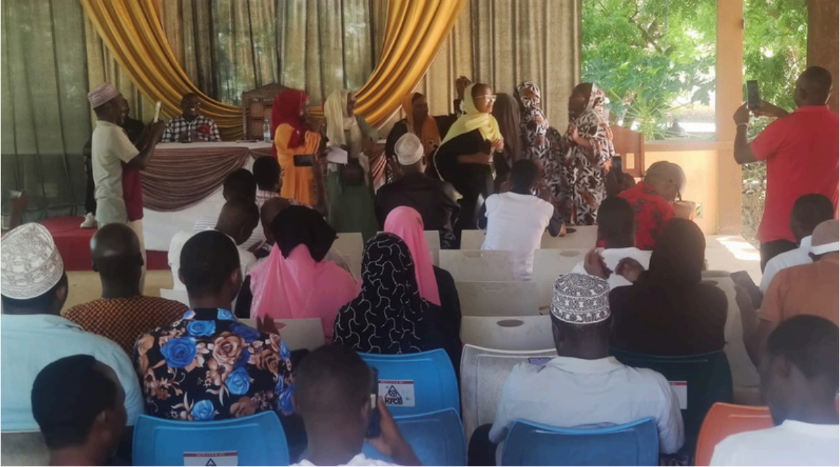
November 10 2024-In collaborative with Nienzi ningali Hai NMK-HTI organized Mashairi festival in recognition of Zuhura's contribution in mashairi and taarab at Mazrui hall, Swahilipot.