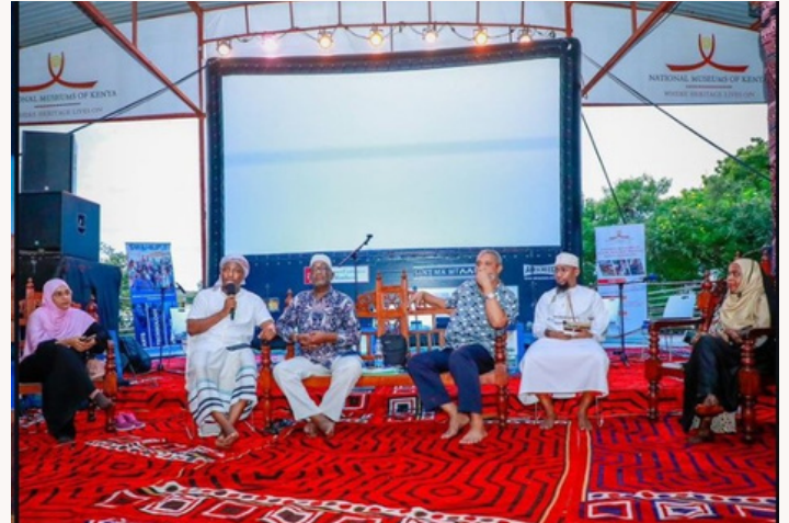
Swahili Scholars discussing the significance of Kiswahili

The Aakhiri Zamani segment was a particular highlight, bringing together various cultural performances including Qaswida, poetry recitals, and engaging showcases of Swahili dance and music. This segment fostered an atmosphere of solidarity and cultural exchange, showcasing the depth and diversity of the Swahili language and its associated traditions.