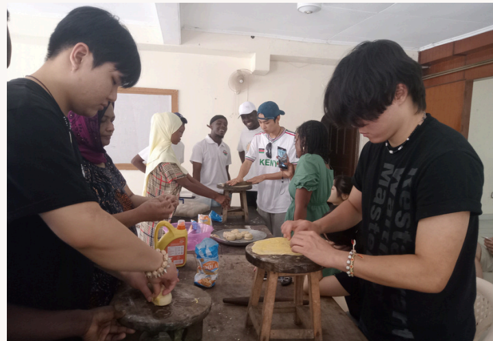
Students learning to prepare Swahili Dishes