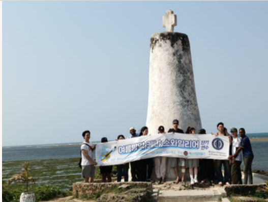
Students During a tour to Vasco da Gama Pillar