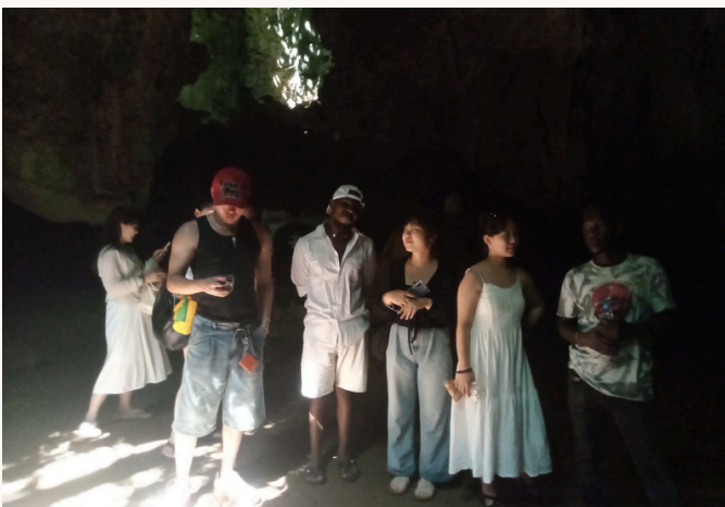
At Shimoni Slave Caves