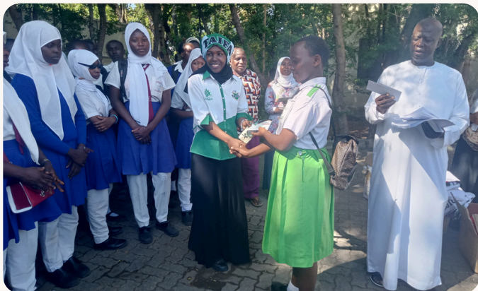
Pupils receive award from Mombasa Maize Millers for extemporary performance during the World Kiswahili Day school competition

The celebrations featured a diverse range of activities catering to all age groups. School competitions showcased young talents in various forms, including insha writing, poetry recitals, and creative writing contests. Notably, Mombasa Maize Millers awarded the best-performing students in these competitions, highlighting their commitment to supporting education and encouraging youth participation