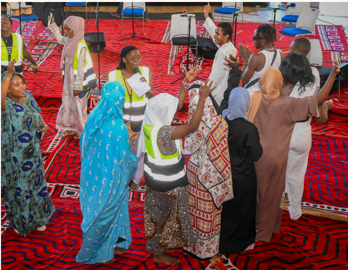
Entertainment during the 2024 World Kiswahili Day Celebrations

The success of World Kiswahili Day 2024 was bolstered by generous sponsorship from local entities, including Mombasa Maize Millers, the Mombasa County Government, and the Swahilipot Hub, Alliance Francais, among others. Their support underscored the community's commitment to preserving and promoting Kiswahili culture, reinforcing the language's role as a unifying force within the region.