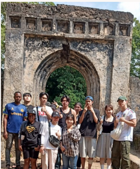
Tour to Gede Ruins

Overall, the Wanati Program effectively combined language instruction with cultural immersion, equipping students with practical Swahili skills and a profound appreciation for Kenya's rich heritage. This transformative experience fostered a deeper connection to Swahili culture, leaving participants inspired and motivated to continue their language learning journey.