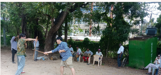
Students engaging in Cultural Dances

The curriculum included health-related vocabulary, with students describing body parts and ailments through role plays and songs. They practiced shopping and bargaining in a simulated market environment, culminating in a field trip to McKinnon Market where they could apply their language skills in real-life situations. The program concluded with evaluations of their language and cultural understanding, alongside a second cooking workshop focused on traditional dishes like Pilau and Tamarind Juice.