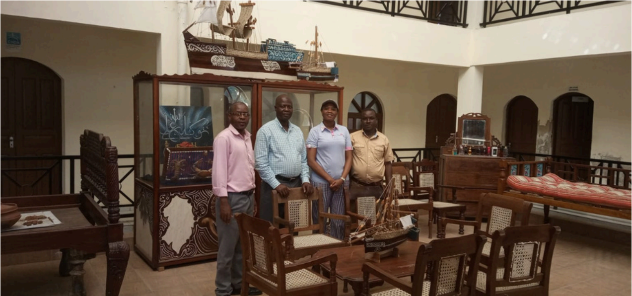
NMK HR Director during a courtesy call to NMK-HTI on 19th September 2024