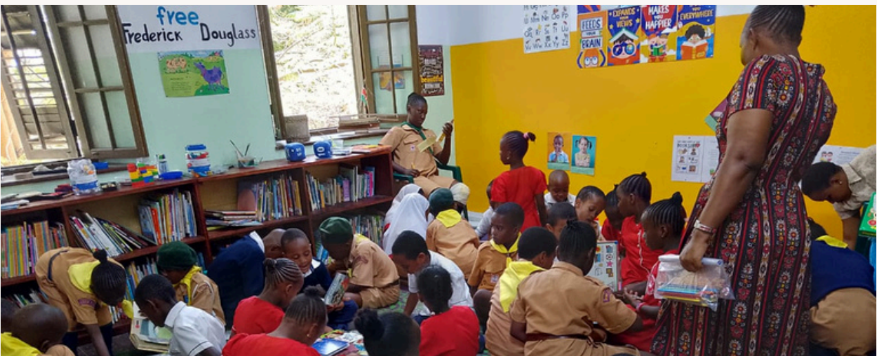
Royal Junior Academy Mombasa visiting the Children's Library at the Resource Center