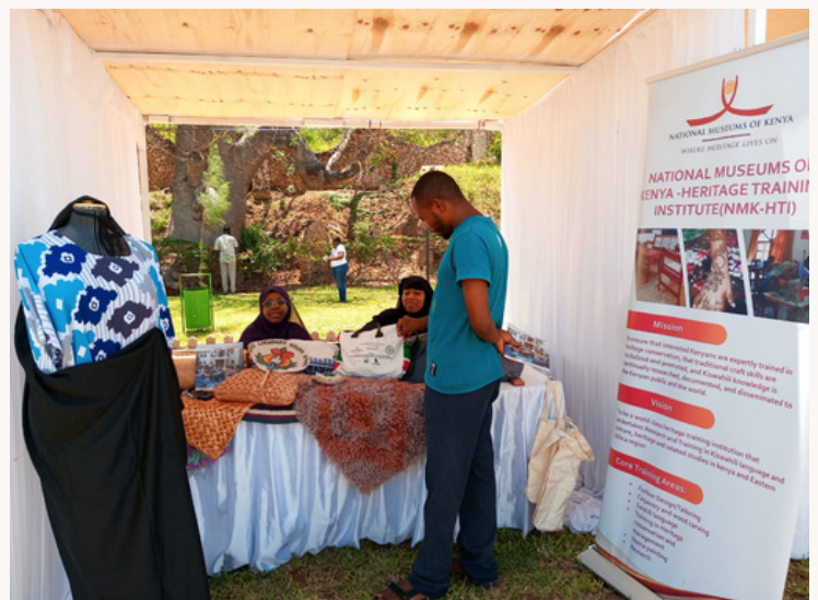
NMK-HTI Products during the Pwani Innovation Week

The Pwani Innovation Week, organized by Swahili Pot Hub, took place from October 14th to 18th, 2024, at NMK Park, bringing together innovators, creatives, and leaders for a dynamic week dedicated to technological advancements and networking opportunities. With the theme "The Pwani We Desire: Youth, Culture, Peace, and Innovation in the Decade of Action," the event showcased a vibrant array of projects and ideas aimed at fostering collaboration and creativity across various sectors.