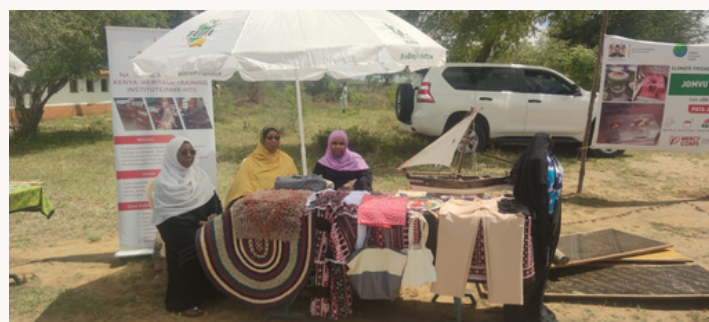
NMK-HTI staff at the Jomvu Cultural Festival

The event was an inspiring reminder of the importance of preserving cultural practices, and NMK-HTI is proud to have been part of such a significant occasion.