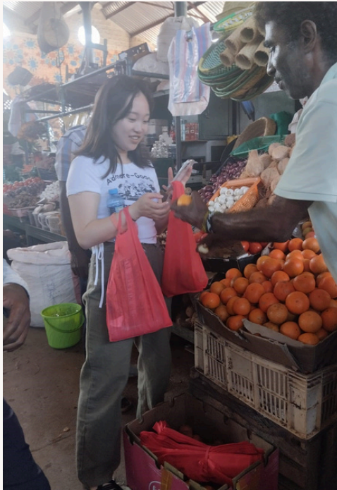
During a field trip to McKinnon Market

A final excursion to Gede Ruins, Malindi, and the Vasco da Gama Pillar provided students with an in-depth cultural and historical experience