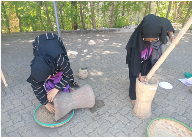
Women Kutwanga Competition during the 2024 Swahili Day Celebrations at NMK-HTI