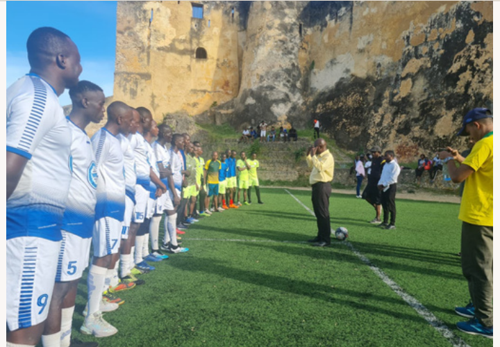
Football tournament at Fort Jesus Grounds during the World Kiswahili Day celebrations

Youth activities added excitement to the festivities, with competitions in sports like football and swimming, as well as engaging sessions in spoken word. Participants beautifully merged traditional dance and music with current and trendy Swahili music, creating a captivating blend that resonated with the audience. The Swahili Cultural Center, Fort Jesus, and SwahiliPopt Hub Foundation became focal points of excitement as both local and international guests enjoyed a lively atmosphere filled with fun, laughter, and learning.