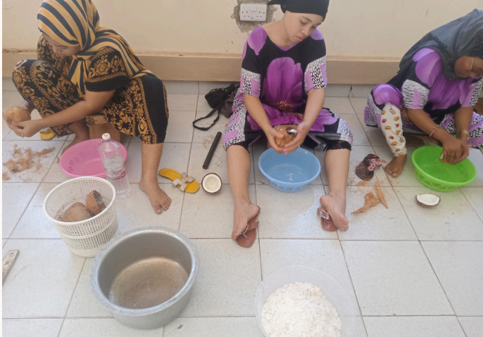
Coconut Grating Competition

In addition to entertainment, meaningful discussions were held, focusing on the challenges women face and strategies to enrich Kiswahili culture among the youth. These conversations emphasized the importance of empowering women as custodians of cultural heritage.