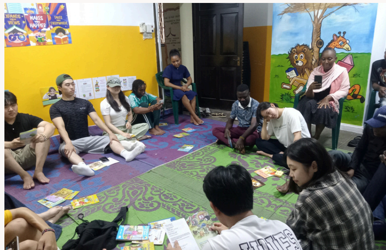
Students practicing reading some of the Swahili books available at the Coast resource Center at NMK-HTI

A final excursion to Gede Ruins, Malindi, and the Vasco da Gama Pillar provided students with an in-depth cultural and historical experience